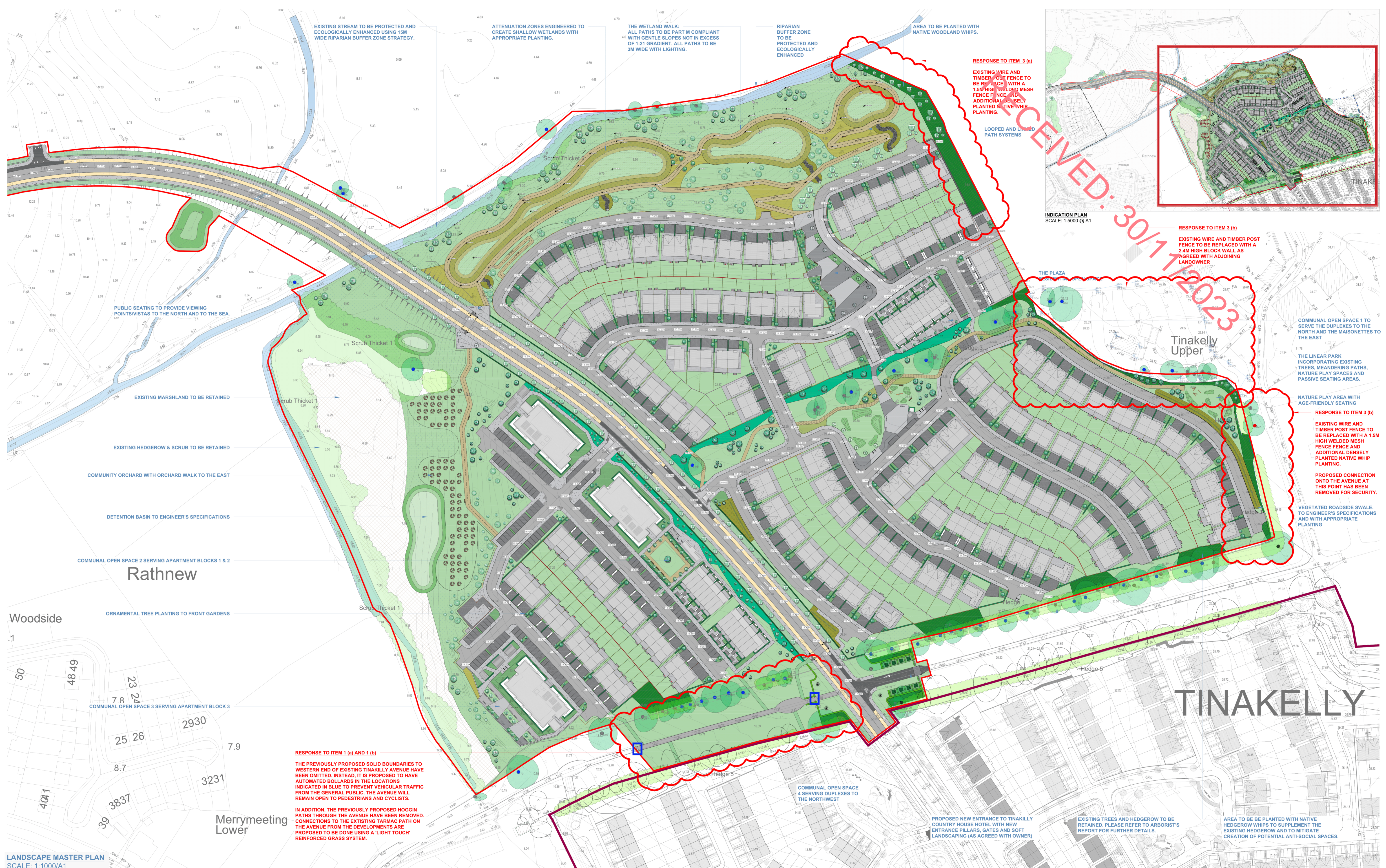
LANDSCAPE MASTER PLAN SCALE: 1:1000/A1

DO NOT SCALE FROM THIS DRAWING. WORK ONLY FROM FIGURED DIMENSIONS ALL ERRORS AND OMISSIONS ARE TO BE REPORTED TO LANDSCAPE ARCHITECT